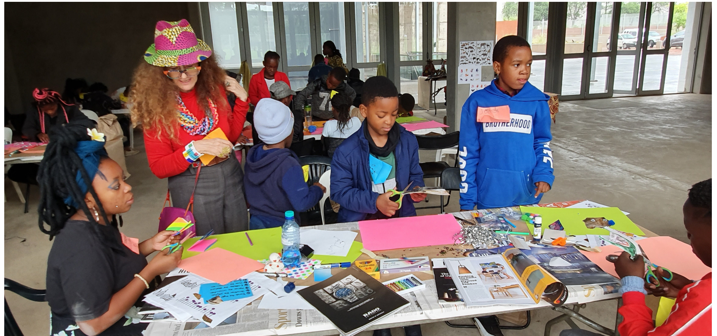
JAVETT ART CENTRE

We are as committed to their career development as we are to their audiences / patrons / collectors.