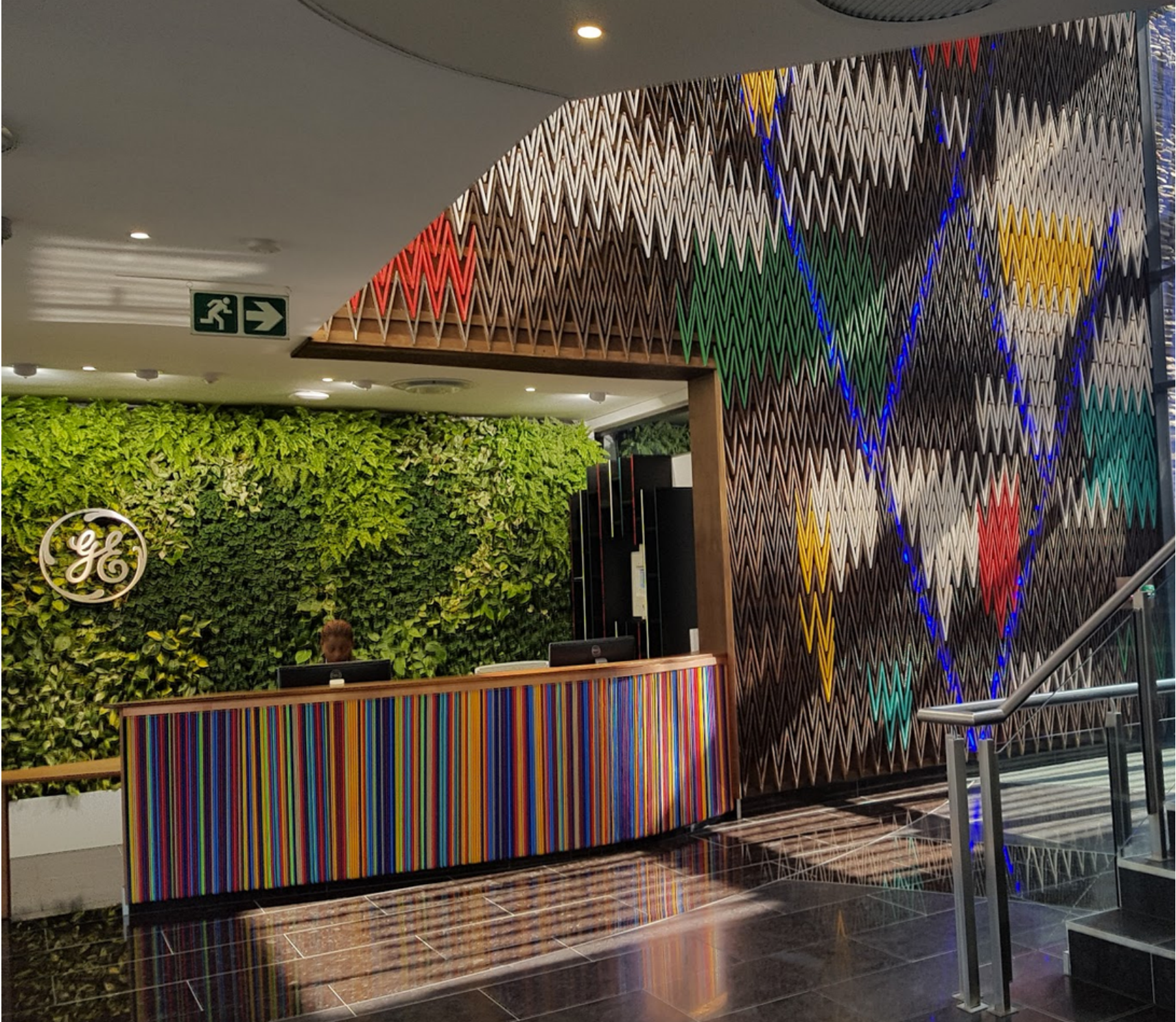
Gordon Institute of Business Science 2014 - 2016 GE Africa Innovation Centre 2016 - 2018 (seen here)