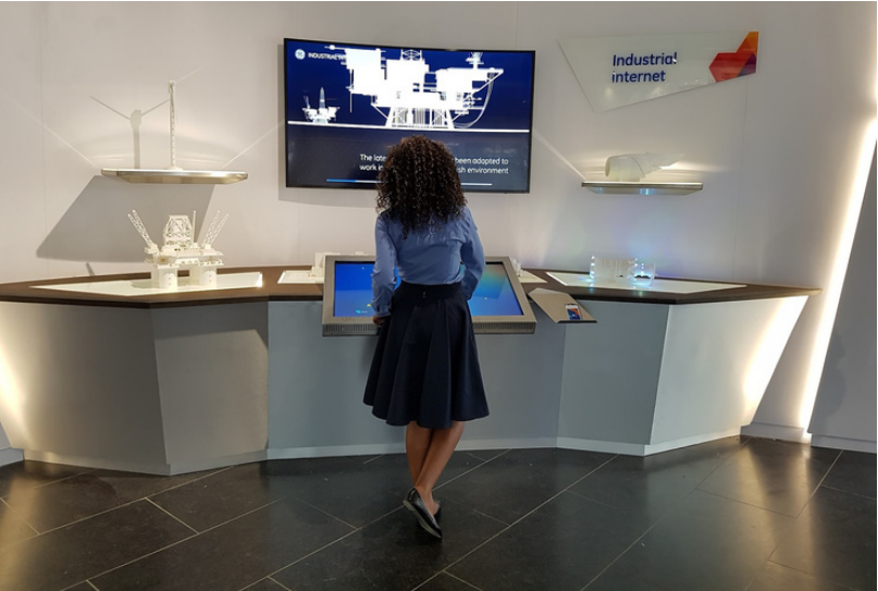
Interior design Art and Design Commissions Digital Exhibition Curation Workshop Conception Facilitation Management