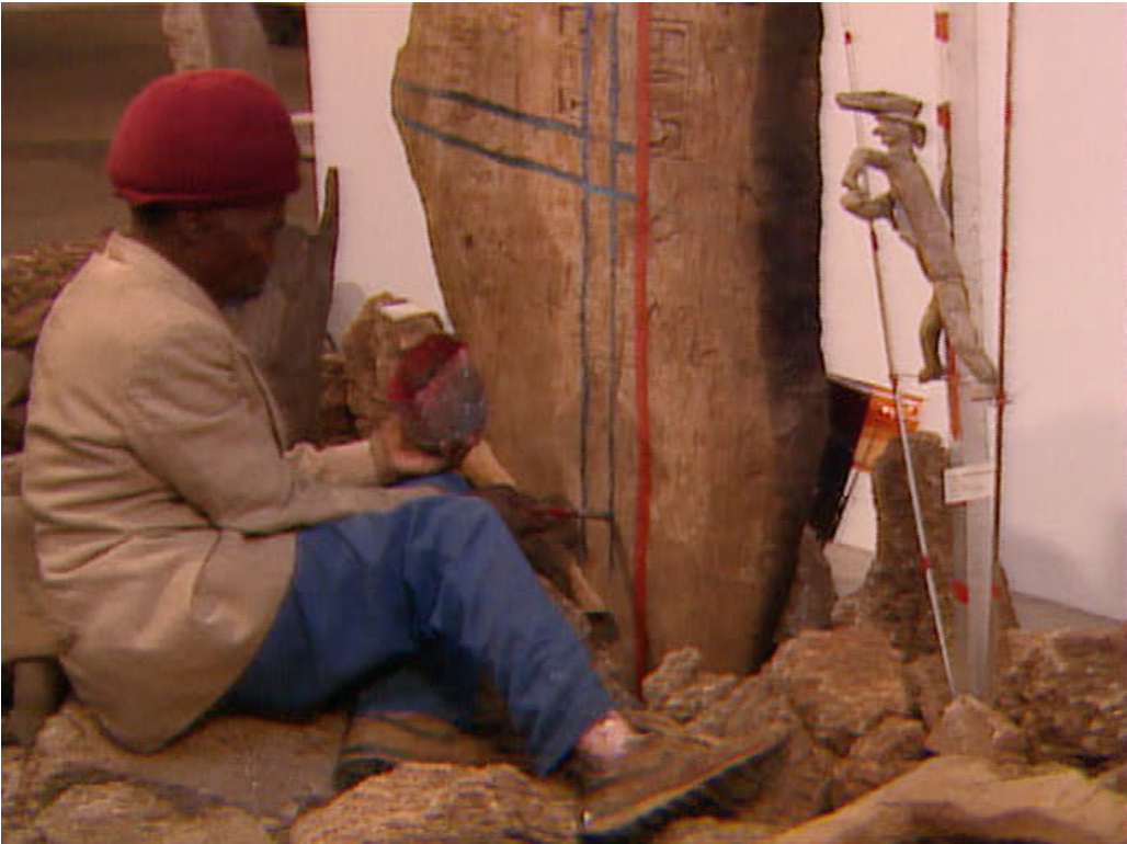
Television programmes 1980 to 1996 Print and Radio 1980 on