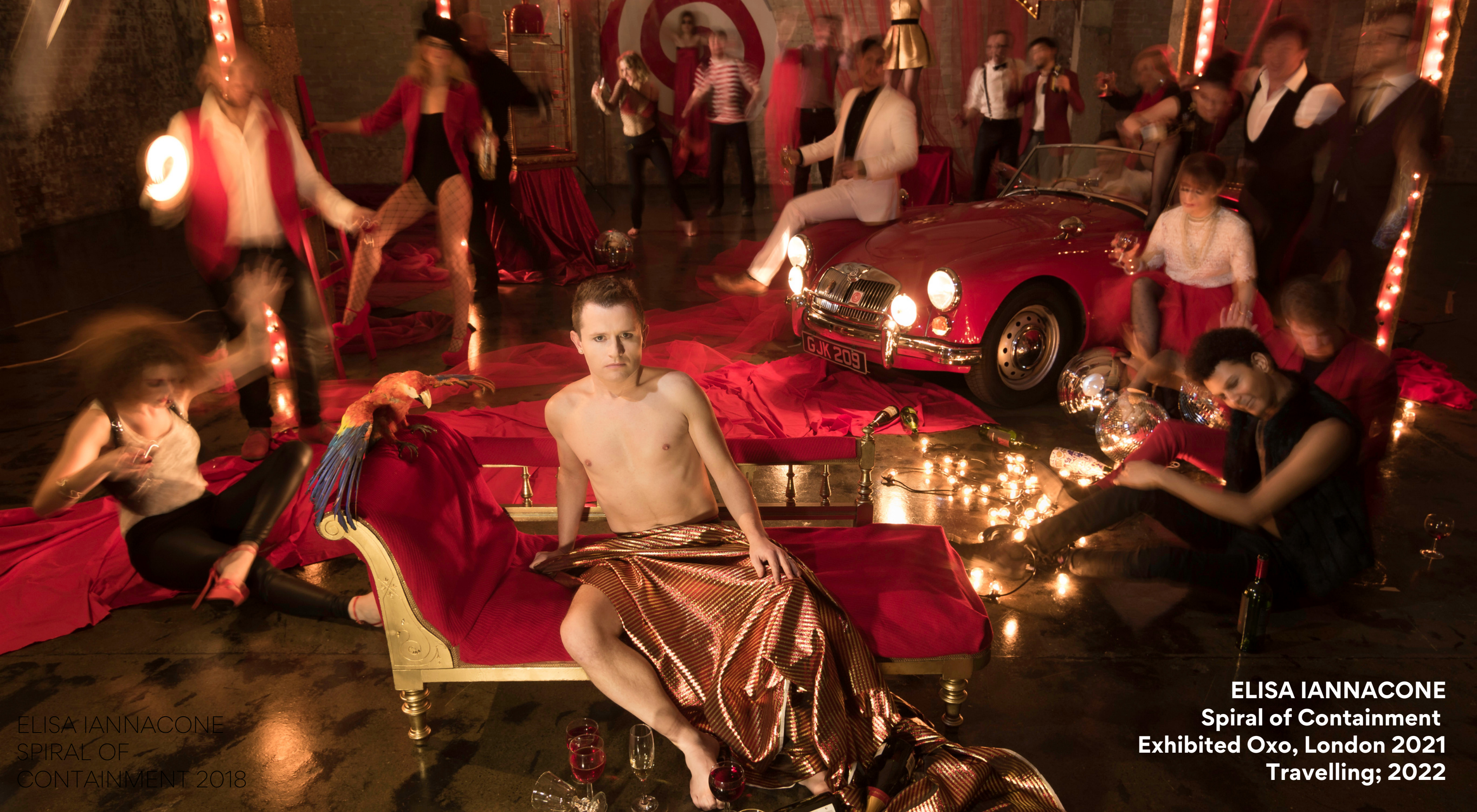
ELISA IANNAZONE SPIRAL OF CONTAINMENT 2018