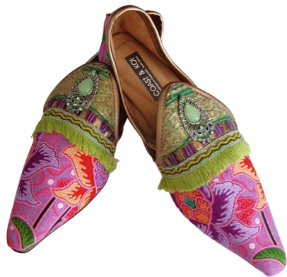
“Art of Everyday Things”, Jaffer Modern, Cape Town, April to June 2021