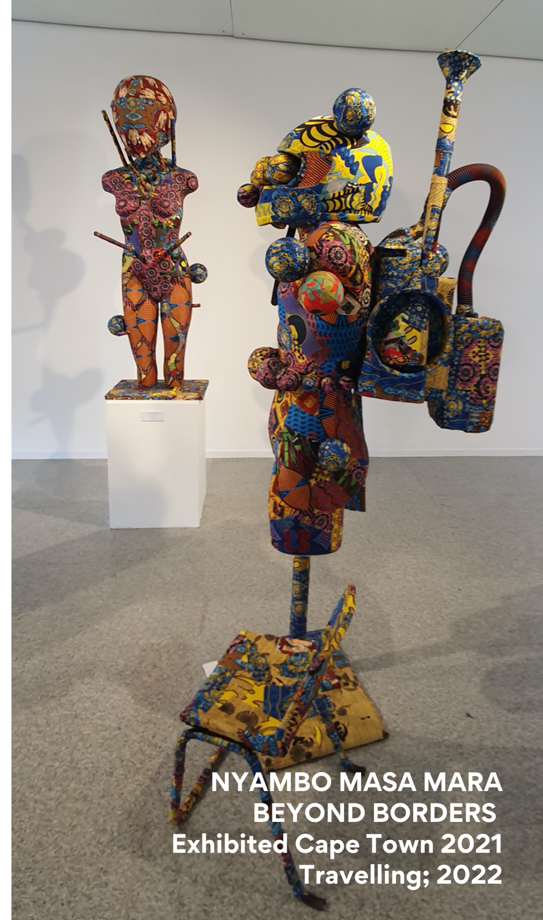
NYAMBO MASA MARA BEYOND BORDERS Exhibited Cape Town 2021 Travelling; 2022