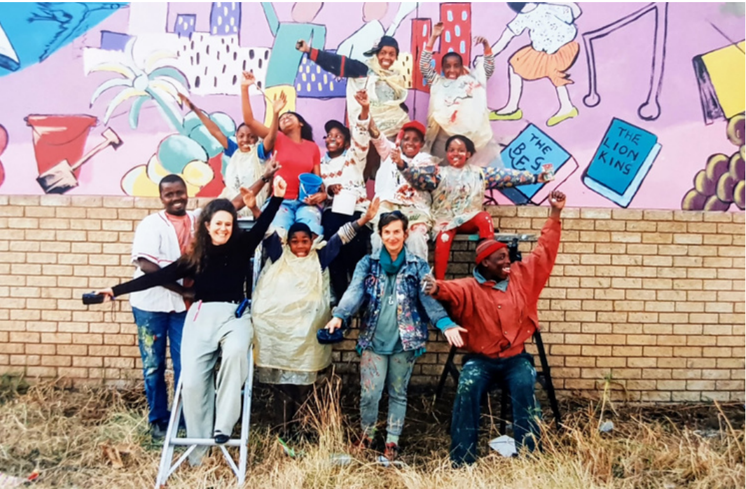
Sponsored Child Murals in major townships across South Africa 1996