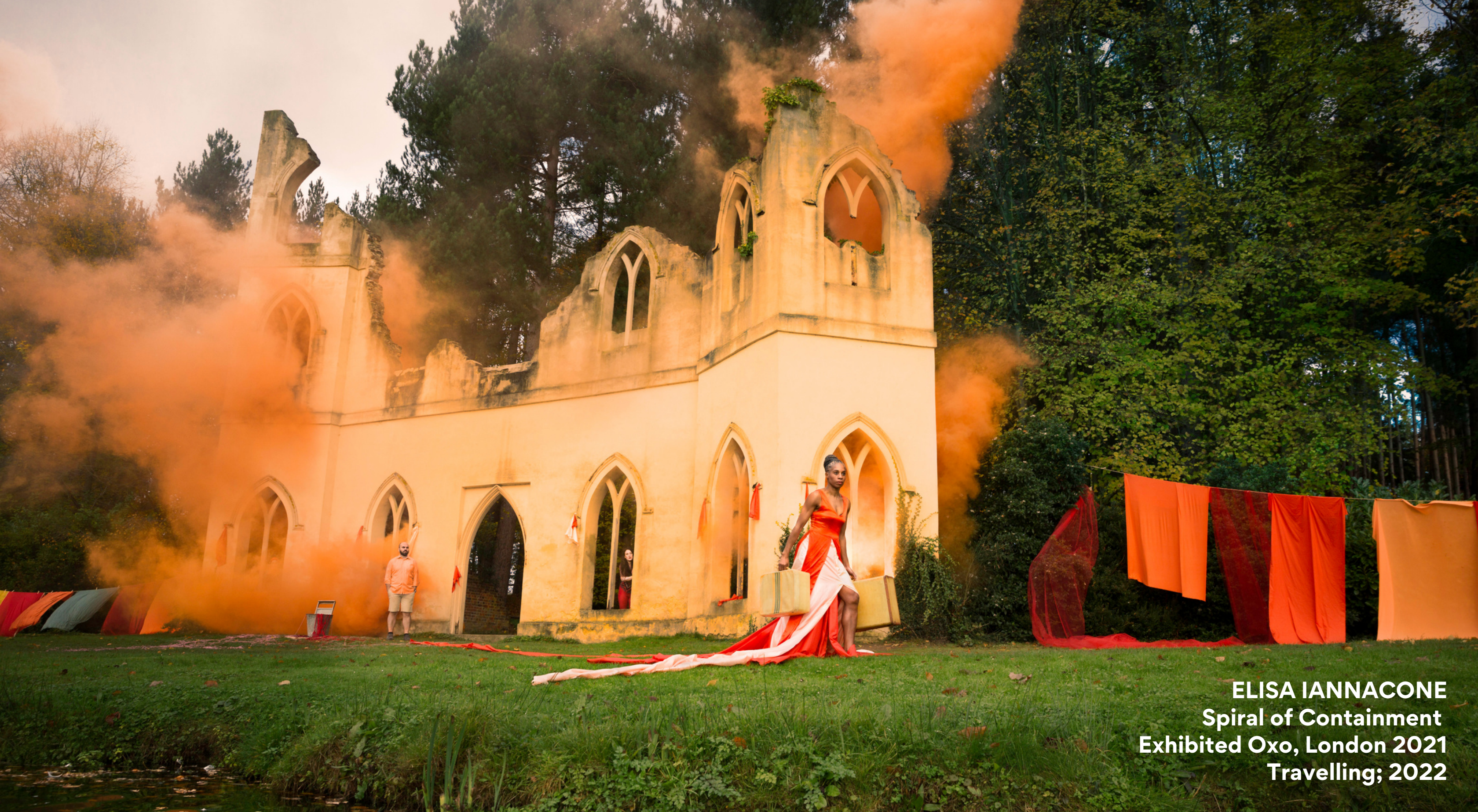
ELISA IANNAcone Spiral of Containment Exhibited Oxo, London 2021 Travelling; 2022