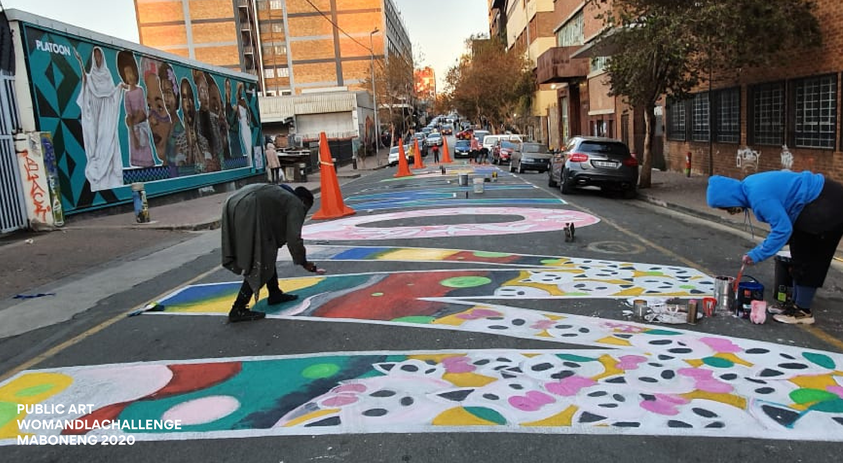
PUBLIC ART WOMANDLACHALLENGE MABONENG 2020