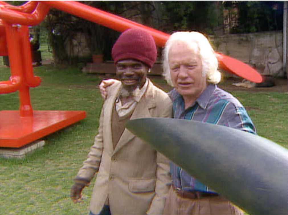
From our archives: Jackson Hlungwane retrospective (Johannesburg) and Visit to Edoardo Villa